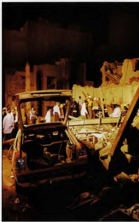
AFTER THE ATTACK ON THE MOUNT LEBANON HOTEL

tic crisis after September 11 and was briefly unable to design structures resembling the rubble of modern buildings. Asaad's looted and burned factory looks remarkably like a heavy-metal version of Gehry's Guggenheim in Bilbao, Spain, with waves of steel, buckled by fire, lying in terrifyingly beautiful golden heaps. Yet all was not lost. "The looters were good-hearted," one of Asaad's painters told me, explaining that they left the tools and machines behind, "so we could work again." Because the machines are still there, many factory managers in Iraq say that it