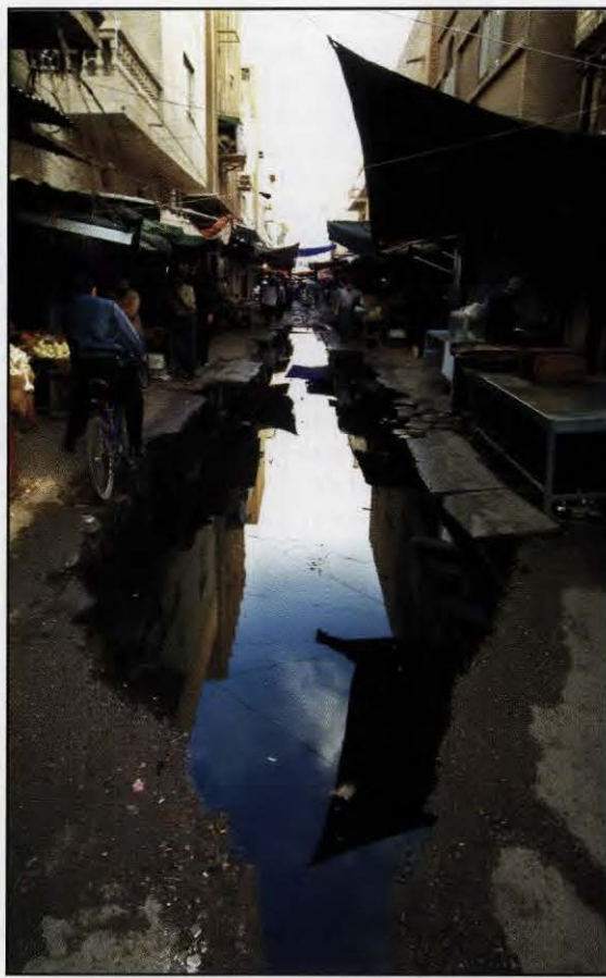
SEWAGE FLOWS THROUGH THE STREETS OF BAGHDAD

The great historical irony of the catastrophe unfolding in Iraq is that the shock-therapy reforms that were supposed to create an economic boom that would rebuild the country have instead fueled a resistance that ultimately made reconstruction impossible. Bremer's reforms unleashed forces that the neocons neither predicted nor could hope to control,