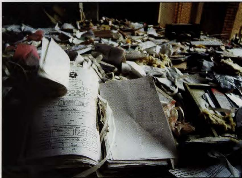
AN IRAQI TELECOMMUNICATIONS CENTER, BOMBED DURING THE WAR

Future of Iraq Project, which generated a thirteen-volume report on how to restore basic services and transition to democracy after the war. On the other side was the "Year Zero" camp, those who believed that Iraq was so contaminated that it needed to be rubbed out and remade from scratch. The prime advocate of the pragmatic approach was Iyad Allawi, a former high-level Baathist who fell out with Saddam and started working for the CIA. The prime advocate of the Year Zero approach was Ahmad Chalabi, whose hatred of the Iraqi state for expropriating his family's assets during the 1958 revolution ran so deep he longed to see the entire country burned to the ground—everything, that is, but the Oil Ministry, which would be the nucleus of the new Iraq, the cluster of