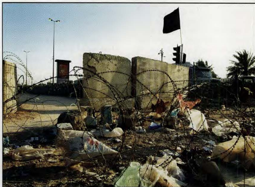
A BLAST WALL TO PROTECT AGAINST EXPLOSIONS

in general, and the two agendas effortlessly merged. Together, they came to imagine the invasion of Iraq as a kind of Rapture: where the rest of the world saw death, they saw birth—a country redeemed through violence, cleansed by fire. Iraq wasn't being destroyed by cruise missiles, cluster