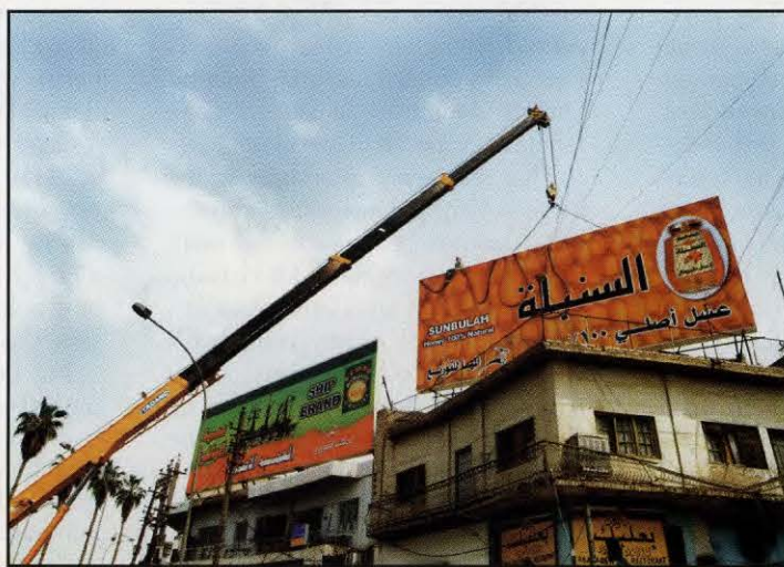
SUNBULAH HONEY BILLBOARD, BAGHDAD

war's ideological architects: that greed is good. Not good just for them and their friends but good for humanity, and certainly good for Iraqis. Greed creates profit, which creates growth, which creates jobs and products and services and everything else anyone could possibly need or want. The role of good government, then, is to create the optimal conditions for corporations to pursue their bottomless greed, so that they in turn can meet the