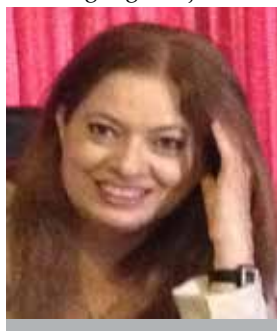
AROUND THE WORLD

Since I first introduced the literary journalism course at the Department of Mass Communication in the fall semester of 2013, the course has proven to be successful—and has since become a major elective for journalism students as well as fulfilling the arts and literature requirement university-wide. When I first started teaching regular journalism courses,